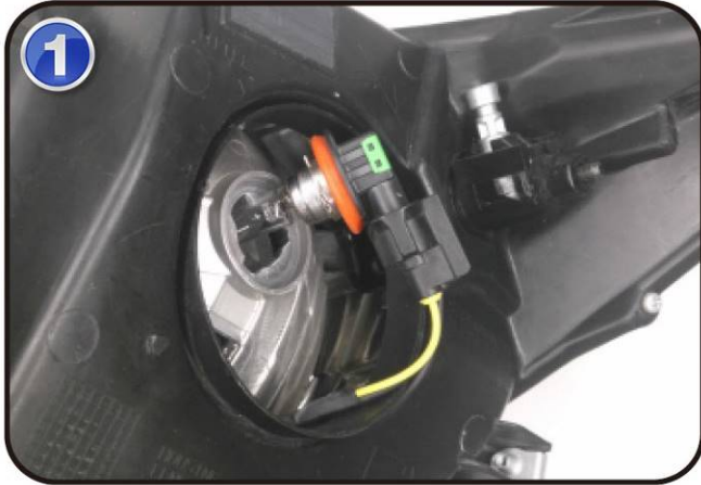
1 REMOVE DUST COVER (IF EQUIPPED) AND REMOVE OLD BULB. DISCONNECT PLUG.

PLEASE READ THROUGH AND UNDERSTAND THESE INSTRUCTIONS BEFORE BEGINNING. ESTIMATED INSTALLATION TIME: 10 TO 15 MIN.