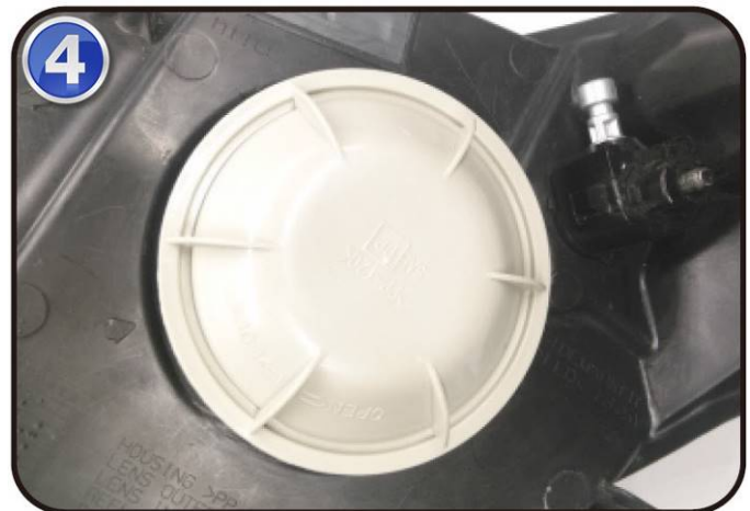
4 REINSTALL DUST COVER (IF EQUIPPED) AND TEST HEADLIGHT