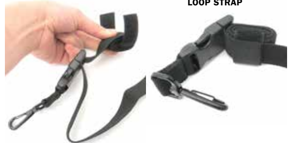
OFF-BIKE VIEW OF STRAPS